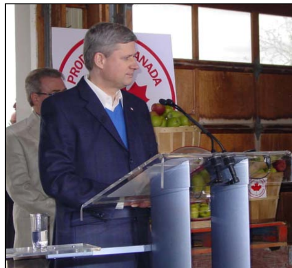
Prime Minister Harper announcing the plan to modernize the federal guidelines used in Canadian Food Labelling.

The current food labelling guidelines, unchanged since the 1980s, do not clearly reflect the actual Canadian content in foods sold in Canada. Under the proposed new guidelines, when a label says "Product of Canada," both the contents and processing of that food must be Canadian. A qualified "Made in Canada" label can be applied to products containing imported ingredients as long as the products are manufactured or processed in Canada.